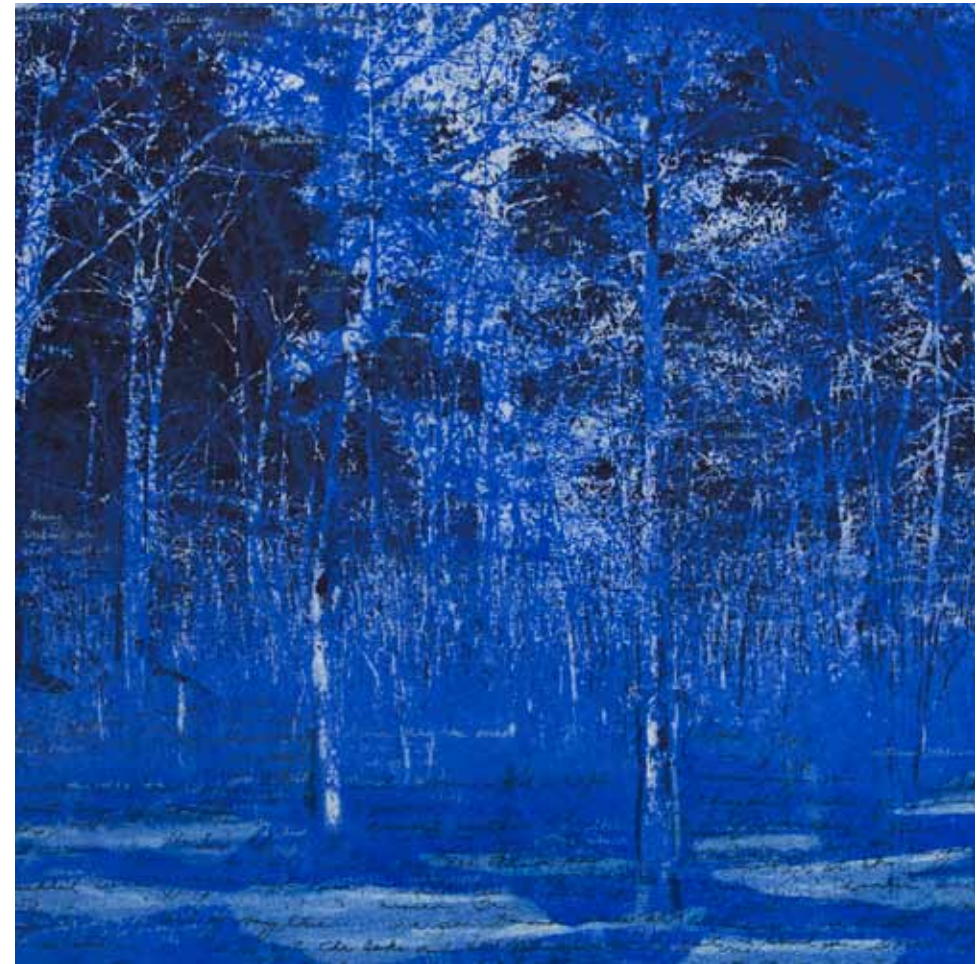
Presence, 2013 18 x 18 inches lithographic monprint