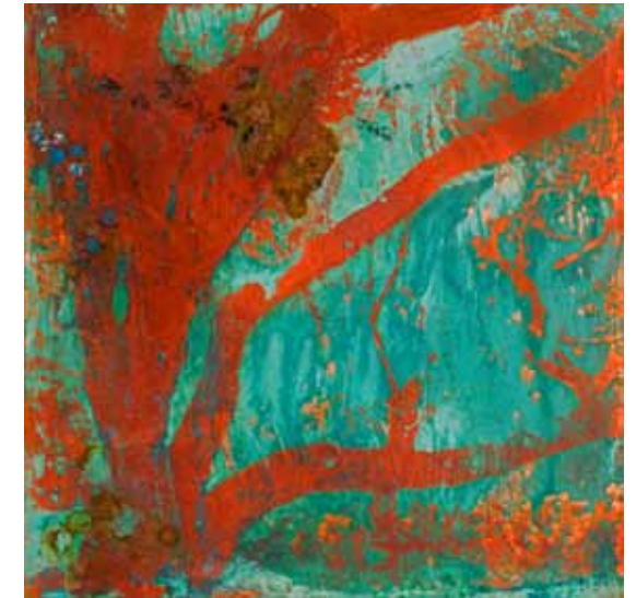
Escape II , 2011 12 x 12 inches lithograph, encaustic, rust printed asian paper, on patinated copper