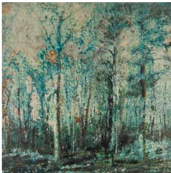
Forest Muse , 2012 24 x 24 inches lithograph, asian paper, encaustic on patinated copper