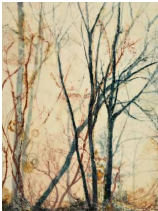
Tree Muse , 2012 24 x 18 inches lithographic monprint, asian paper, horsehair, rust print, encaustic on panel