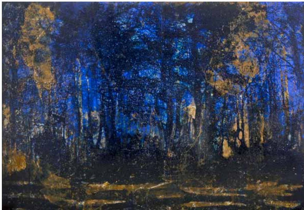
Traces , 2013 18 x 26 inches lithograph on oxidized steel