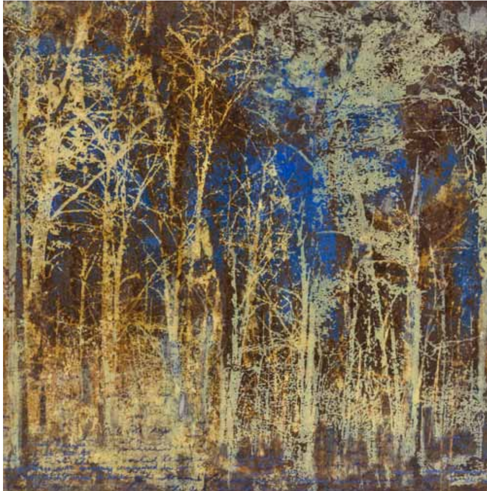
Vestige , 2013 18 x 18 inches lithograph, encaustic on oxidized steel