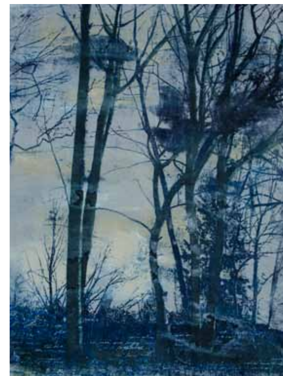
Storm , 2013 23.75 x 17.25 inches lithographic monprint