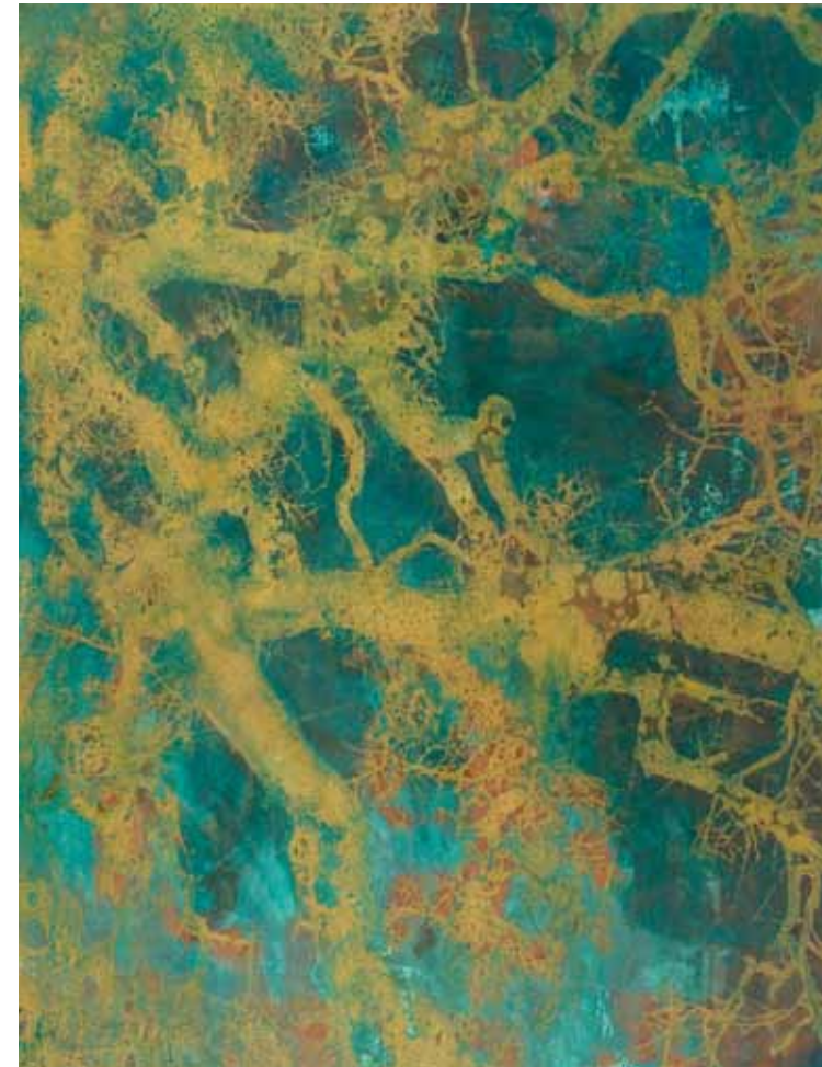
Sulphur Branch II , 2011 24 X 18 inches lithograph, encaustic on patinated copper