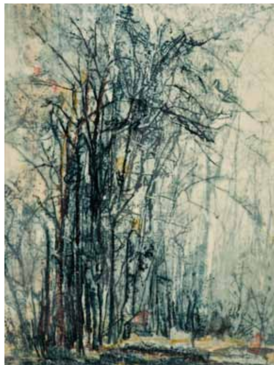
Tree Muse II , 2012 24 x 18 inches lithographic monprint, asian paper, rust print, encaustic on panel