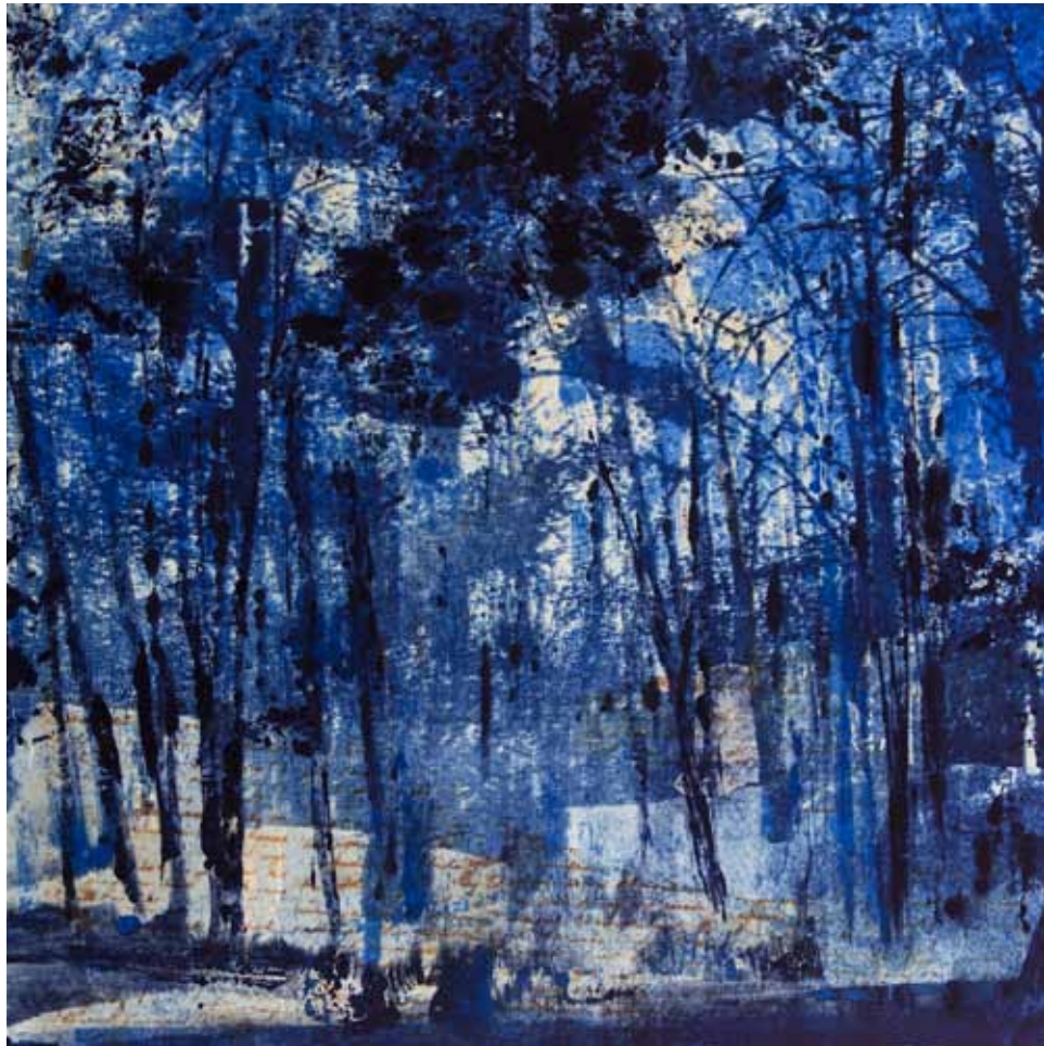
Buried, 2013 18 x 18 inches lithographic monprint