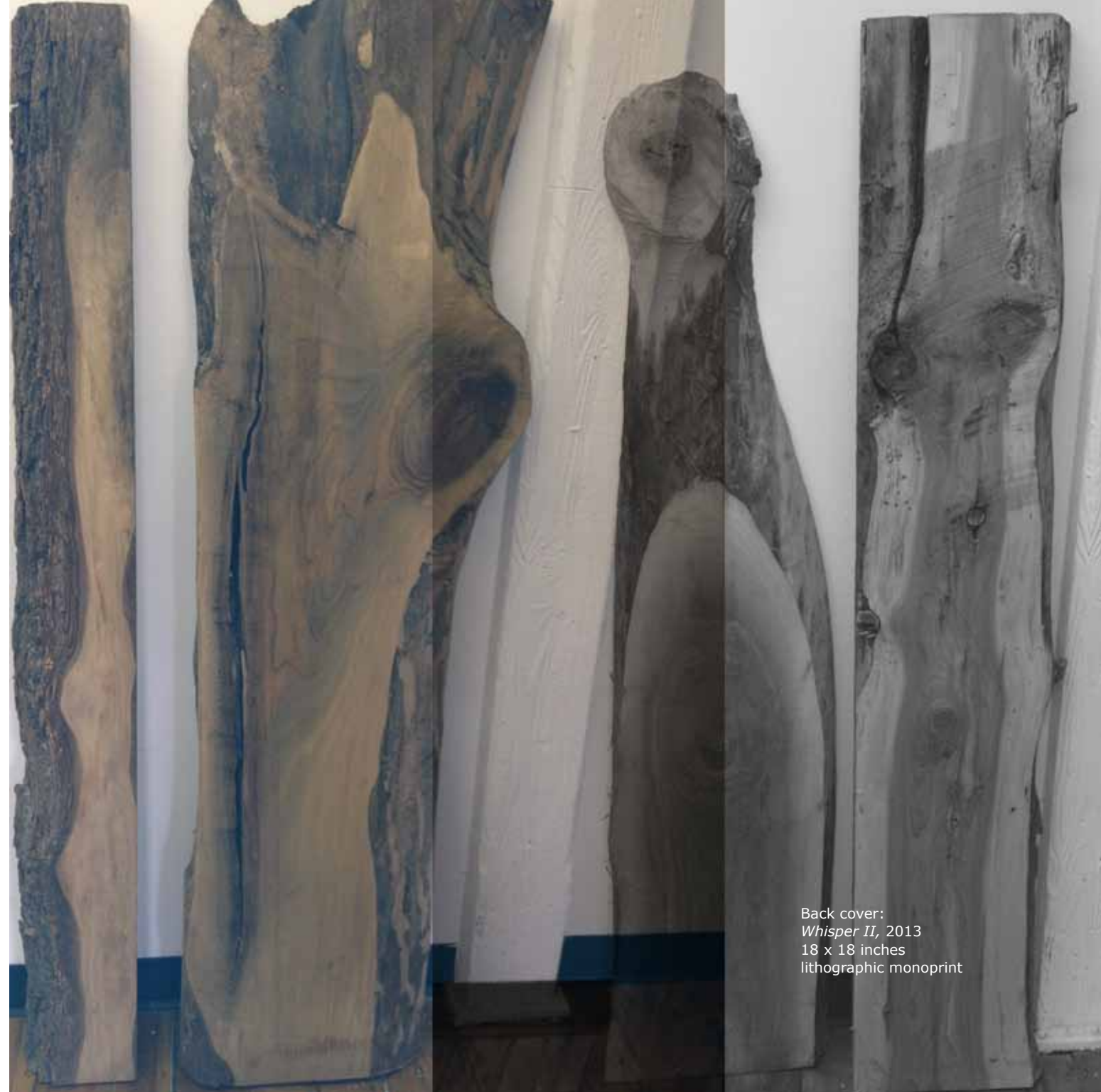
Back cover: Whisper II , 2013 18 x 18 inches lithographic monprint

Catalog design: Peg Patterson www.pegpatterson.com