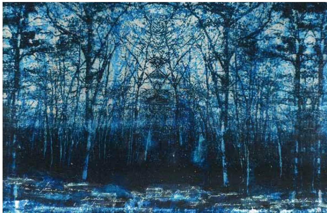
Evening II , 2012 16 x 24 inches lithograph on mirror