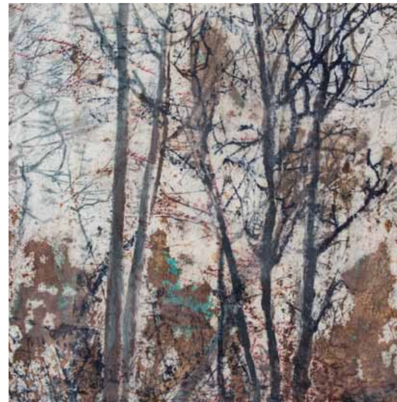
Collecting , 2013 18 x 18 inches lithograph, asian paper, encaustic, on oxidized steel