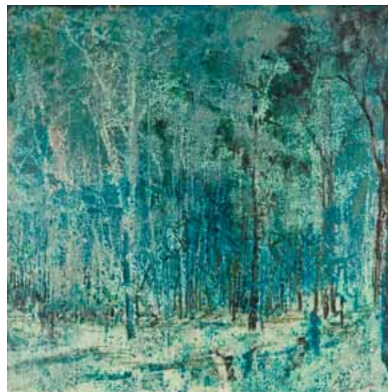
Forest Muse II , 2012 24 x 24 inches lithograph, asian paper, encaustic on patinated copper