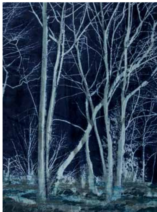
Night Trees , 2013 23.25 x 17.25 inches lithographic monprint