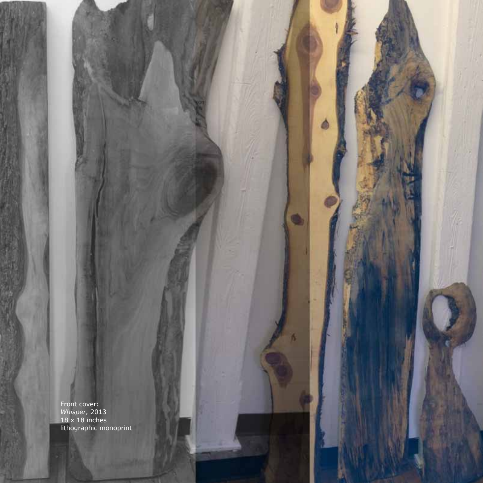
Front cover: Whisper , 2013 18 x 18 inches lithographic monoprint