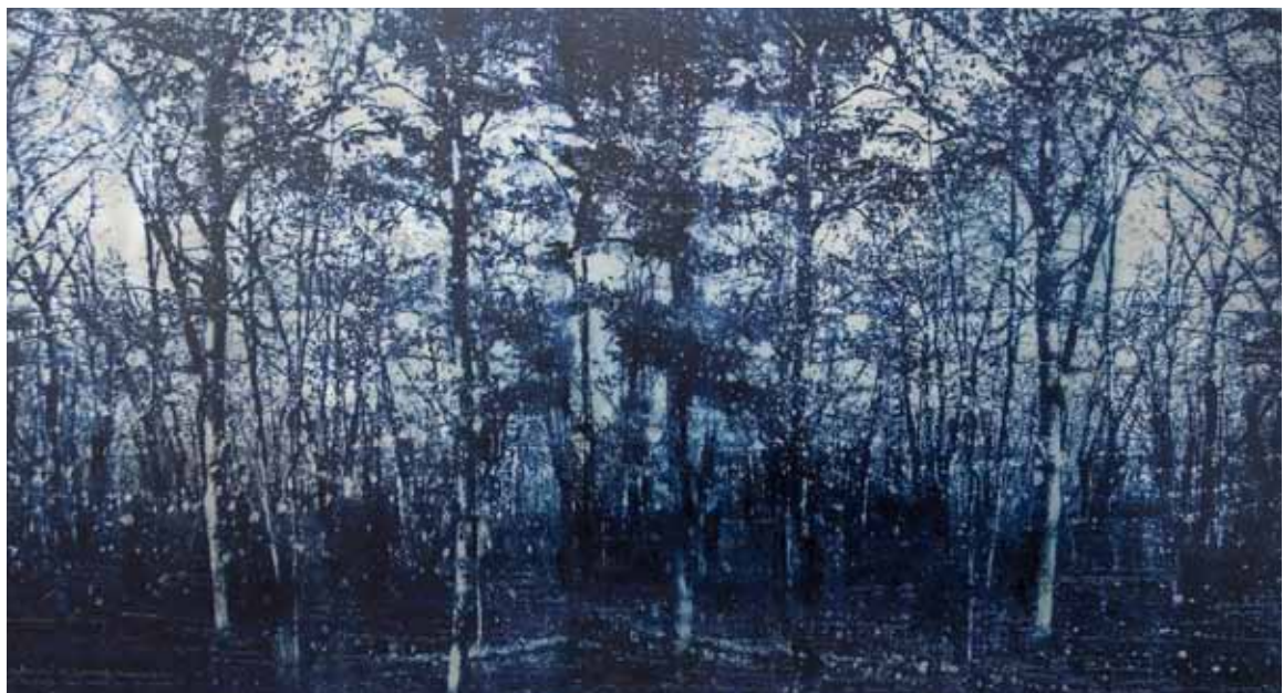
Eventide , 2013 23 x 42 inches lithograph on mirror