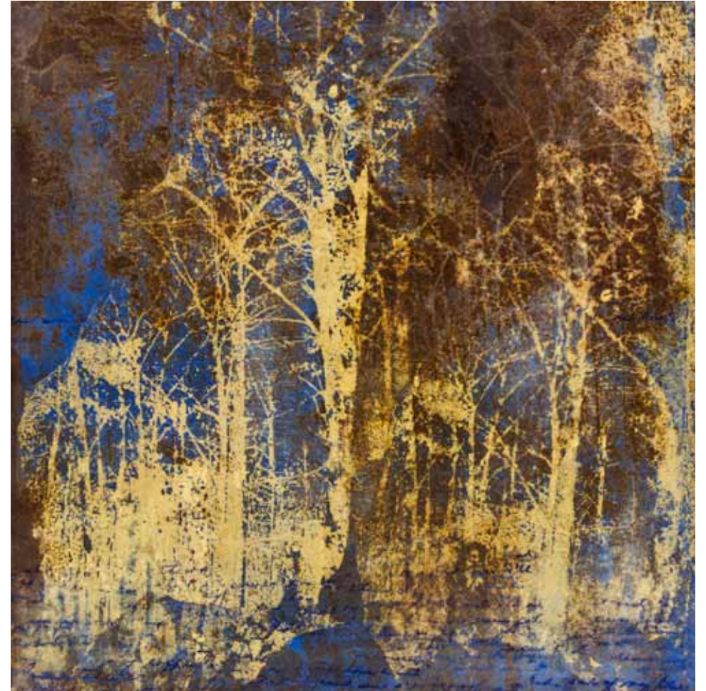
Vestige II , 2013 18 x 18 inches lithograph, encaustic on oxidized steel