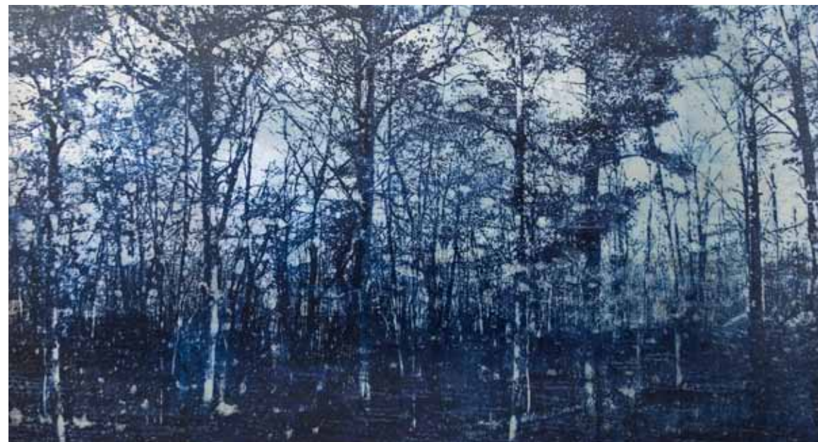
Eventide II , 2013 23 x 42 inches lithograph on mirror