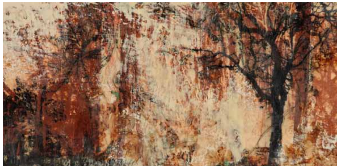
Escape , 2012 12 x 24 inches lithograph, rusted asian paper, encaustic, horsehair, on panel